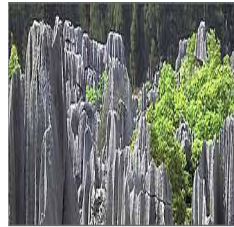
Spike is bad for health

Mountains are said to 'govern person', this implying that beside providing support for a residential it is also affect the residents' health. A good mountain is able to help couples to conceive easily and like wise, a bad mountain will result in difficulties to conceive. In modern Feng Shui, building blocks or high rises are said to represent mountains.