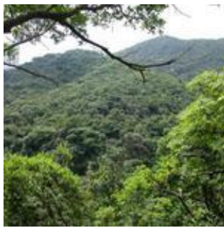
With different growing tress