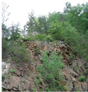
A dying mountain