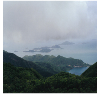
Combined with Water element