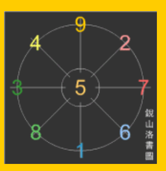
Master Lau's Lok Shu Diagram