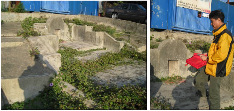
Different angle of the tomb