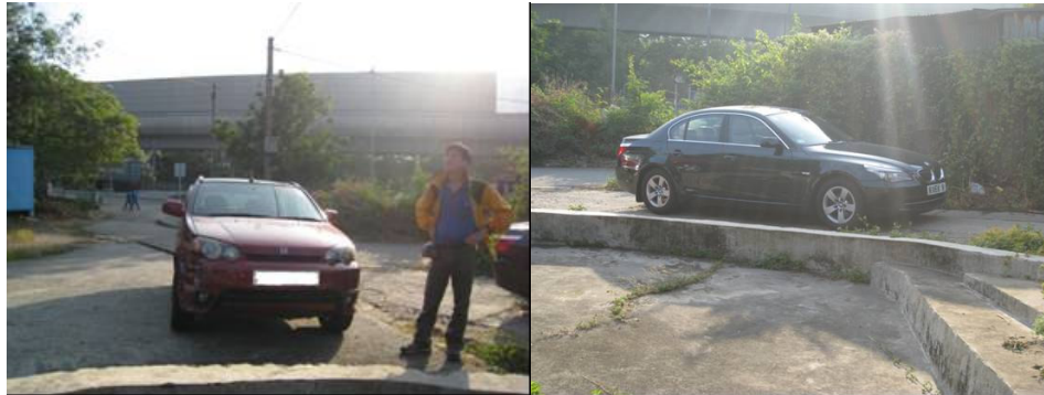
The frontier of the tomb, where you can see the place become busy street with railway passing in front in a developed world.