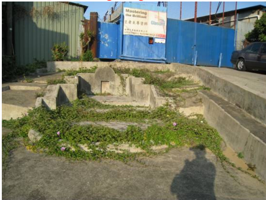
The front view of tomb