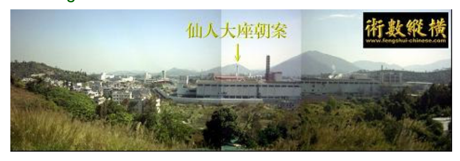
Another angle of the tomb's Peak