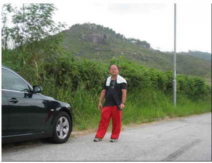
We also visited few other famous tombstones nearby