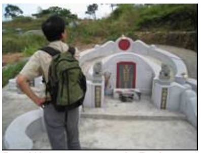
Grand Master examining the Tomb