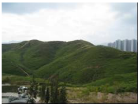
Some with nice support such as left side