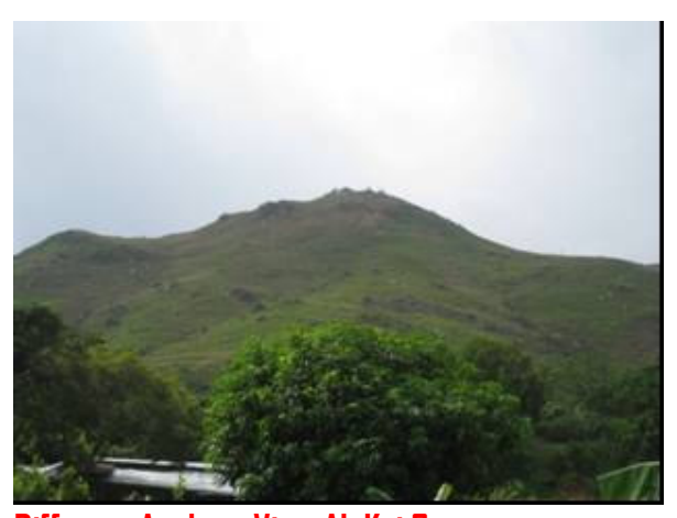
Different Angle to View Ah Kai San