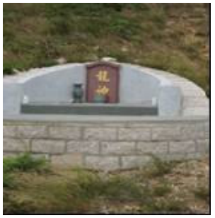
The Real Dragon for a tomb, called the God of Dragon