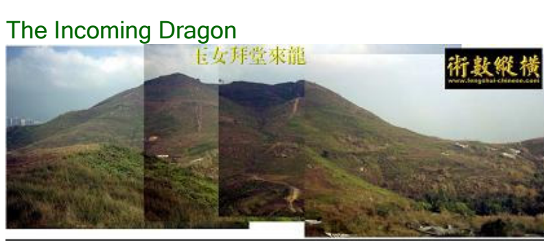
The Bright Hall