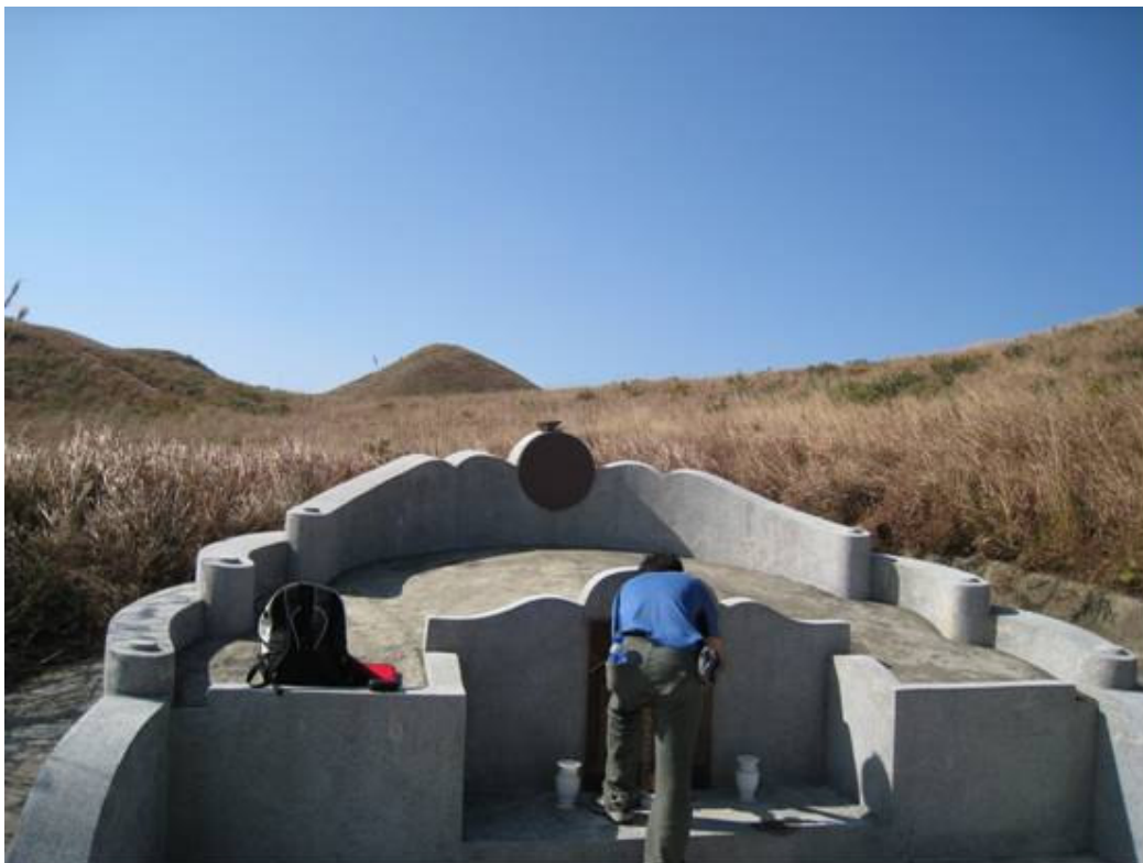
A typical 'Happy Fellow' (樂山) is where the left side is descending; The middle is with another hilltop while the right side is ascending.