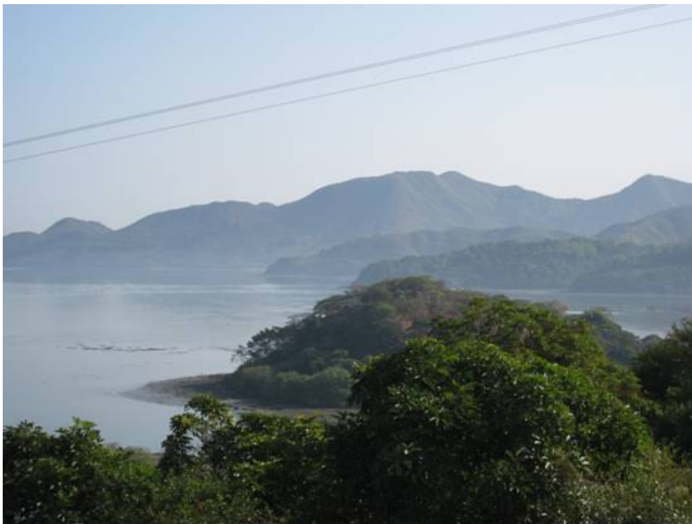
The right side is a wonderful Sha with layers of mountains embracing such site