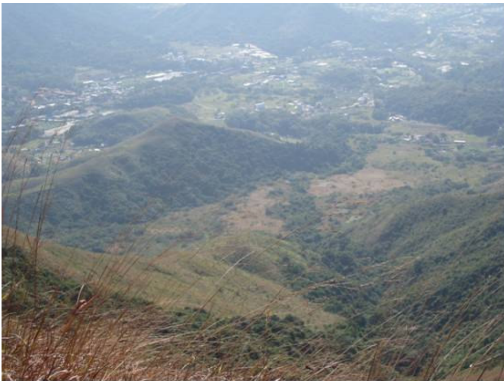
From the top of Hong Far Leng, we can see the dragon branching down and diverged