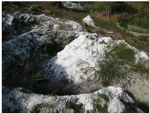
Different Angle of the 'Ant Tomb'

Site 1: The method or technique of burial is called 'Ant Tomb'; this abnormal technique is rare in the Southern part of China.