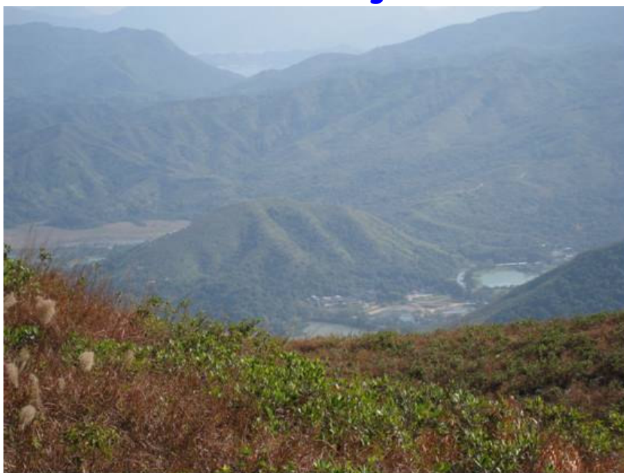
A typical example of a 'Luk Chuen' mountain near by