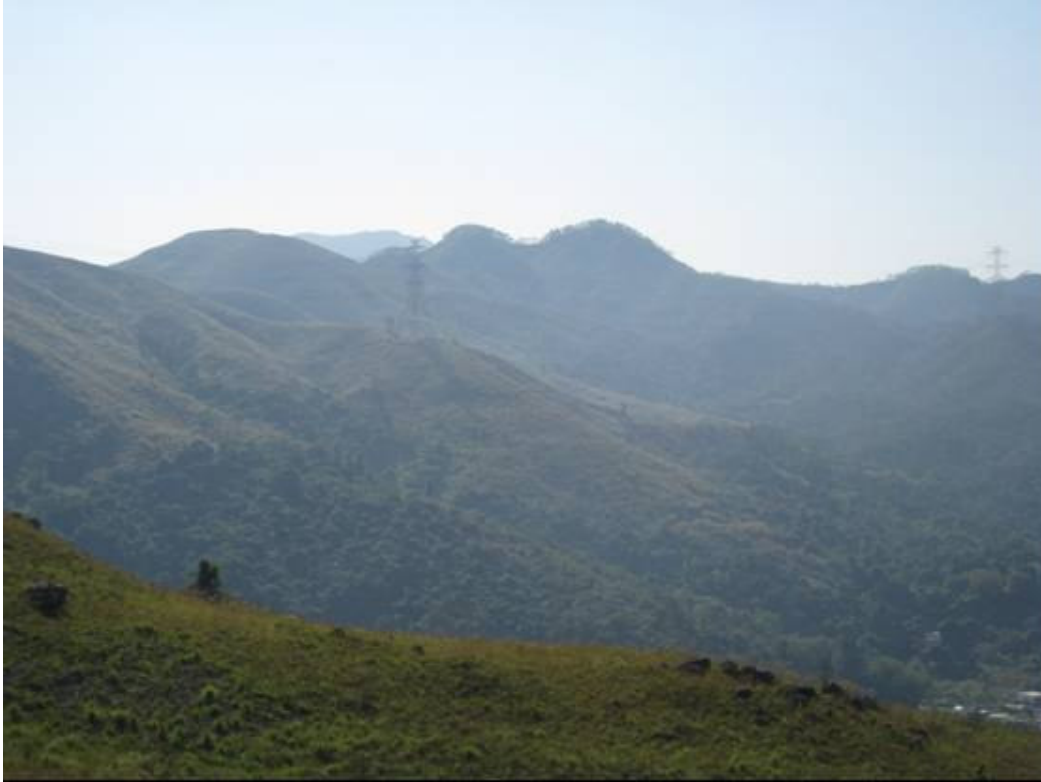
Example of 'camel back'