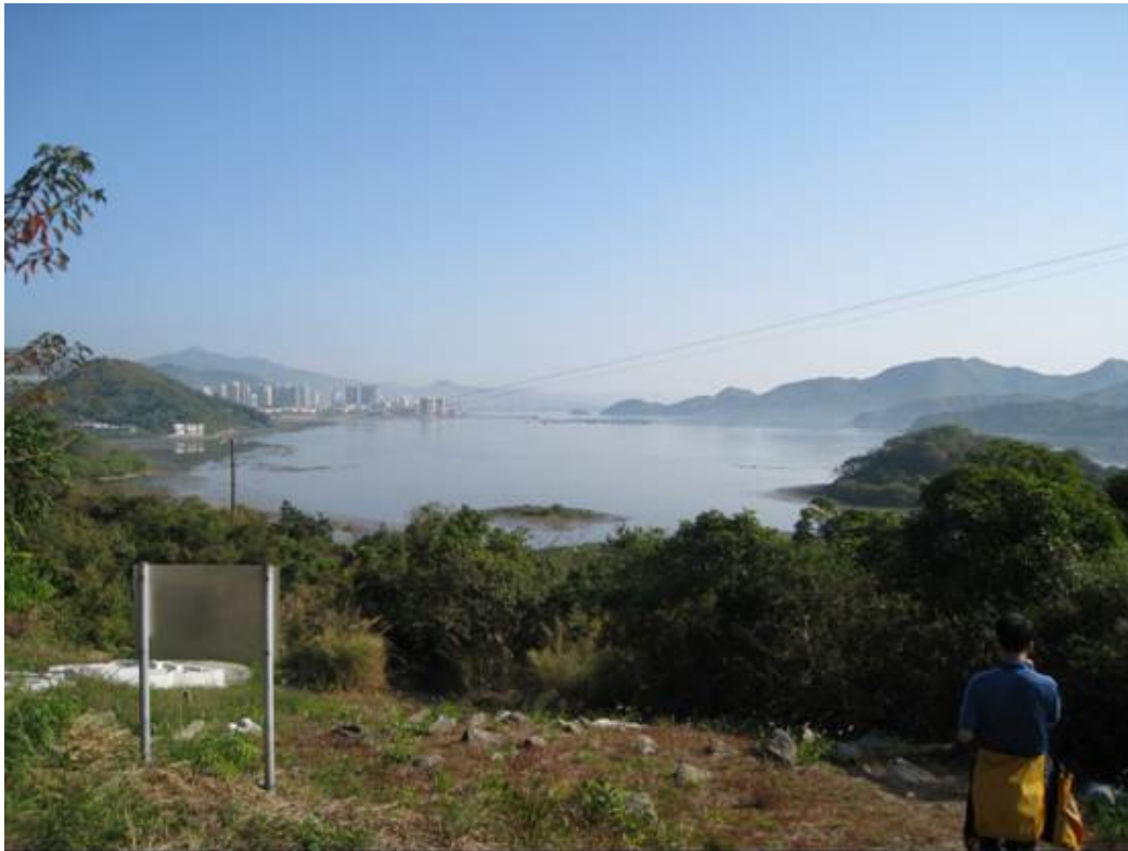
The frontier with water and Sha