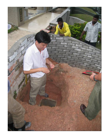
\label{lem:metriculously} \textbf{Meticulously calculate the actual direction and position for the cremation pot}