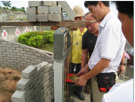
The actual facing direction of the tomb is most important in Yin Feng Shui