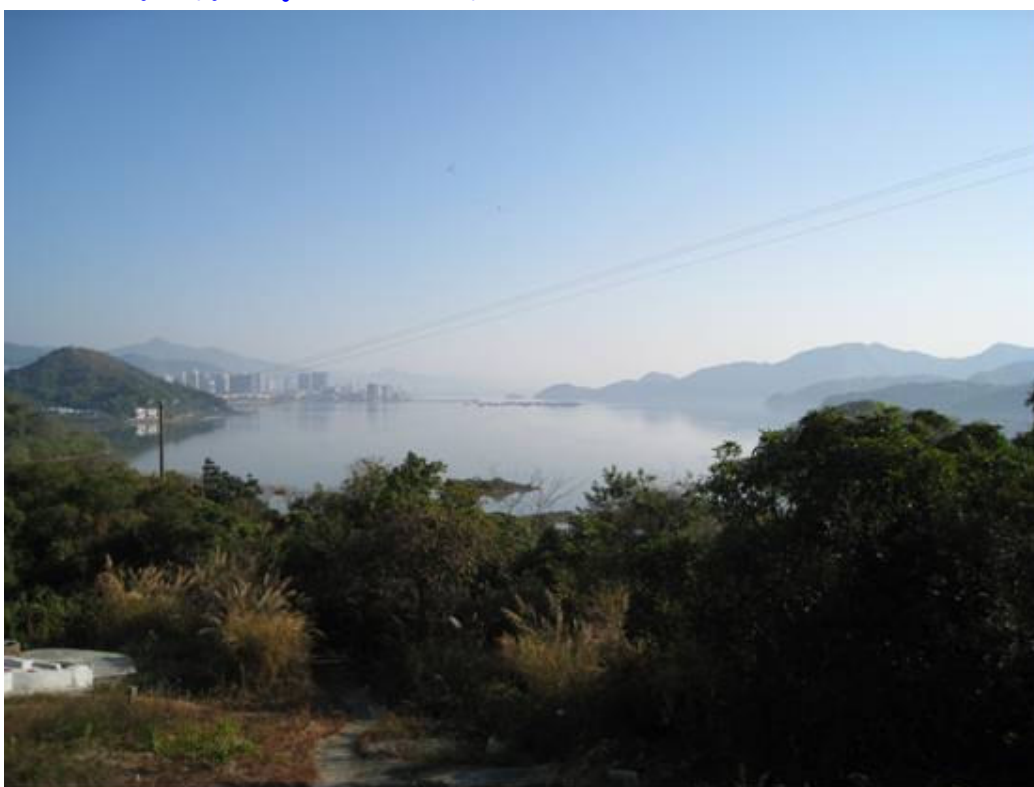
This site revisited! The frontier with marvellous scene with water and nice left and right Shas to protect the site.