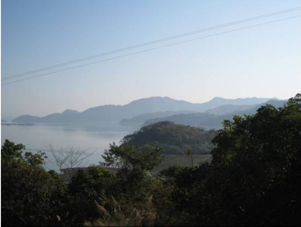
Another angle of the site