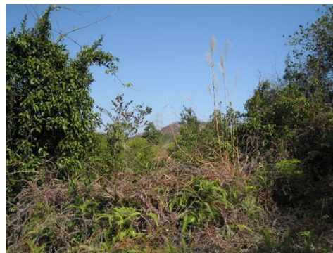
the site with her 'ear clipping technique