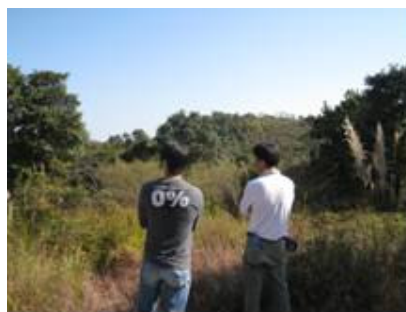
The front side with near 'front' mountain