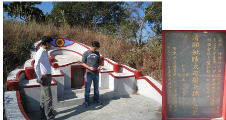
Shas of Vicinity