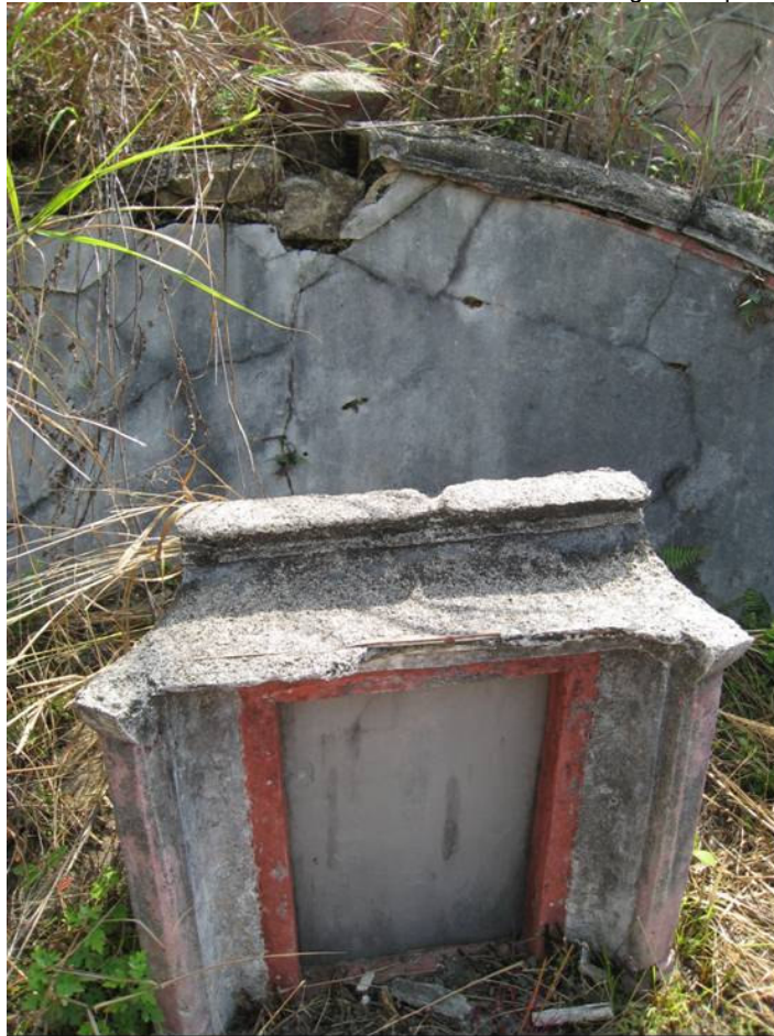
A Ching Era Ancient Tombstone-approximately 200 over years old

It is unwise to act like a real master when you are only half barrel full. Mind you ancient Master or scholar always do not write down their essence of techniques for two reasons, one, they often oral teach the essence to disciples and, they afraid that such techniques might be on the hand of the bad-hearted people. God knows the real essence, but that's always one way we can find out, that's to study the ancient tombs done by prominent masters . Such works cannot be camouflaged and have to be authentic. Their skills and their texts could have differences but only the works (tombs site) can be trusted. The core of the text is to narrow down the focus on the Xuan Kong techniques.