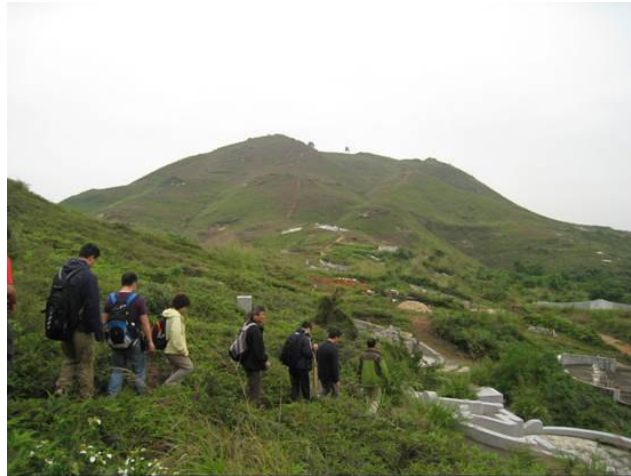
The left Dragon which originated from the Ah Kai San