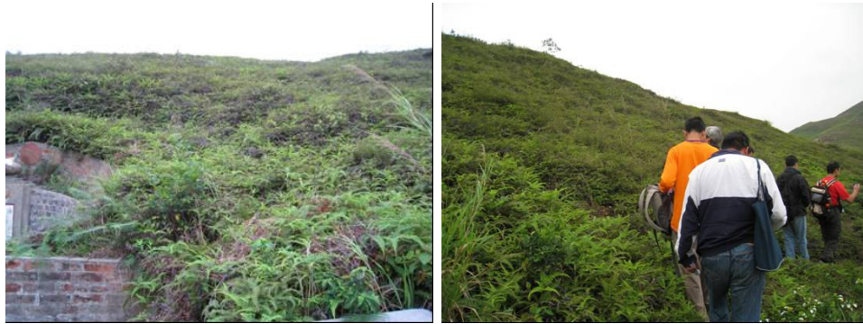
The Tomb site vicinity