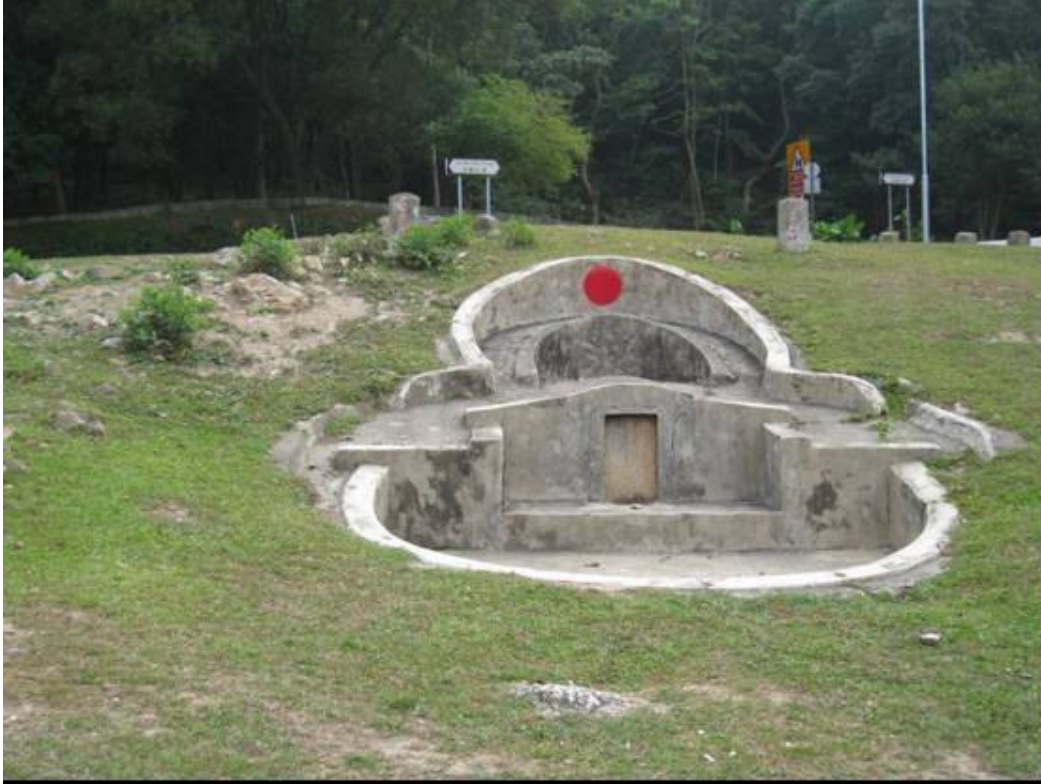
Another example of Yin criss crossing Yang, that in soil searching for rock and wise versa (土中取石)