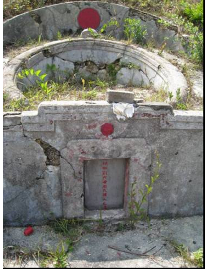
A Ching Era Ancient Tombstone-approximately 200 over years old

It is unwise to act like a real master when you are only half barrel full. Mind you ancient Master or scholar always do not write down their essence of techniques for two reasons, one, they often oral teach the essence to disciples and, they afraid that such techniques might be on the hand of the badhearted people. God knows the real essence, but that's always one way we can find out, that's to study the ancient tombs done by prominent masters. Such works cannot be camouflaged and have to be authentic. Their skills and their texts could have differences but only the works (tombs site) can be trusted. The core of the text is to narrow down the focus on the Xuan Kong techniques.