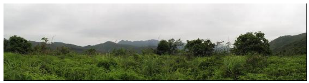
The panoramic rear view of the site