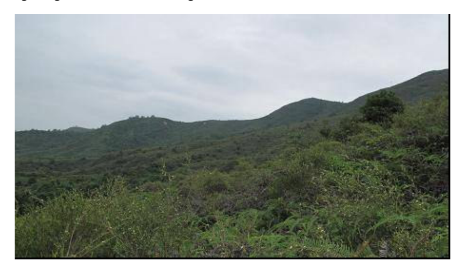
The left Dragon (青龍) with beautiful layers of mountains embracing the site.

Still the right tiger with different angle.