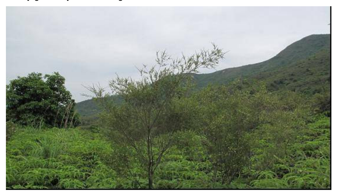
The site required extensive and careful analytical Ying Feng Shui knowledge, finally Sifu pinpoint the exact location of where the!