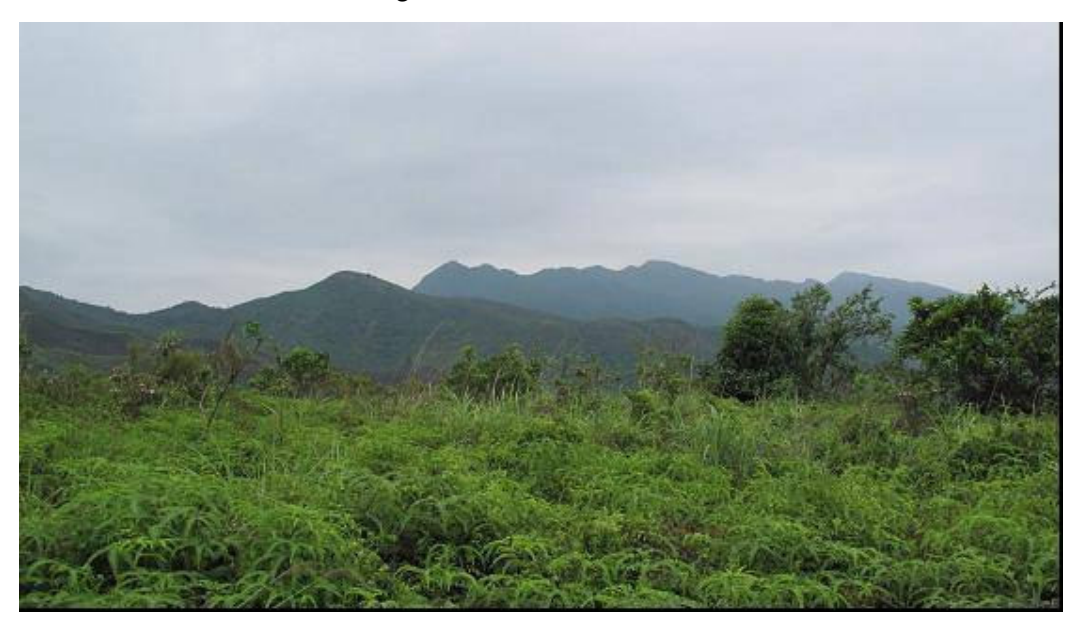
The frontier view with different angle 2

The frontier view with different angle 1