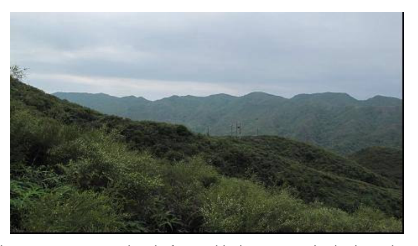
Look at the rare awesome view in front with the same criteria those layers of mountains embracing the site (i)