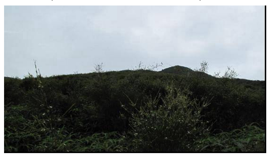
Our right tiger (白虎) embraced such side nicely and neatly without strong wind.

We found the 'bump' 星頂 that we needed to dictate the spot of the meridian!