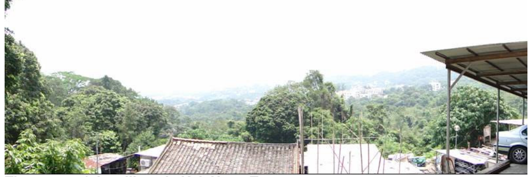
The name of the village is Kak Hang Tun

Another panoramic view of a village that with strong dragon breathe