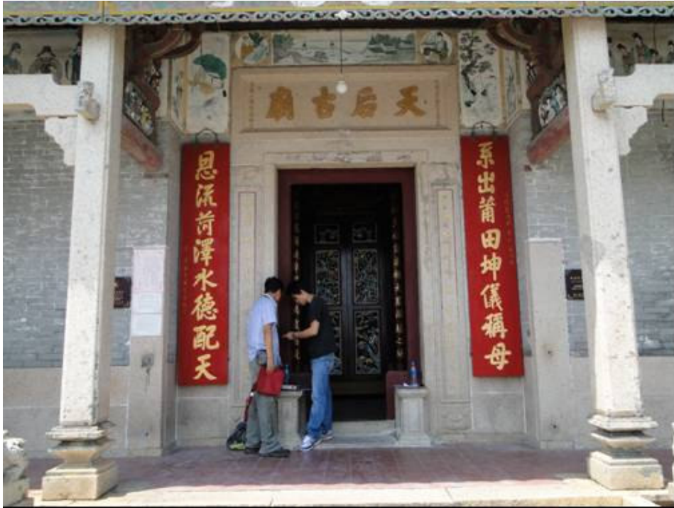
Panoramic view of the front temple

This temple which was surprisingly built in the year 1266! And is under renovation.