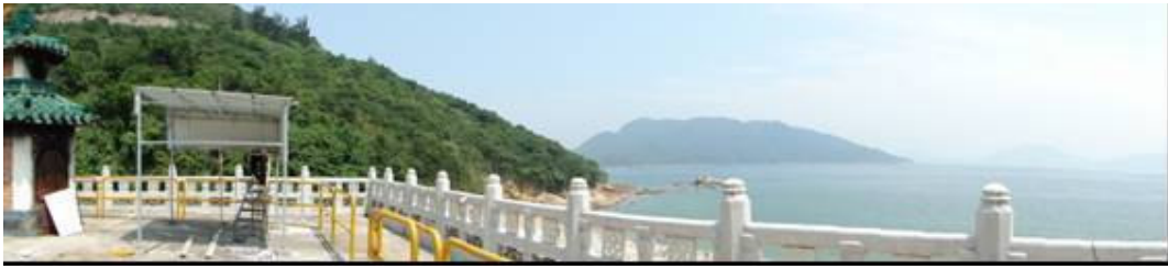
Another angle of the site, see the frontier (朝案) that is a pre-requisite for a good site.