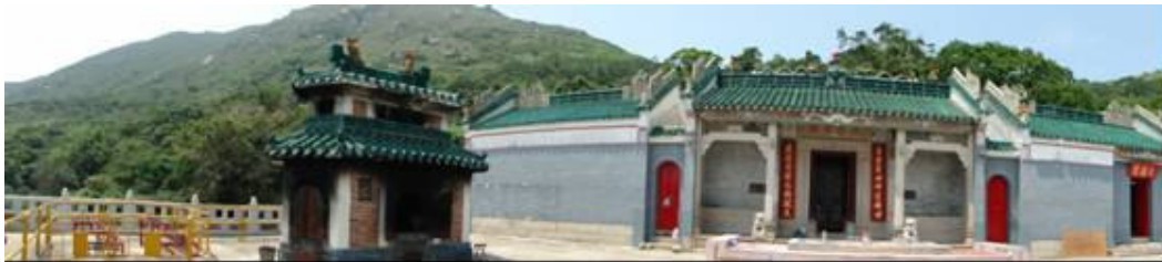
Panoramic view standing in front of the temple