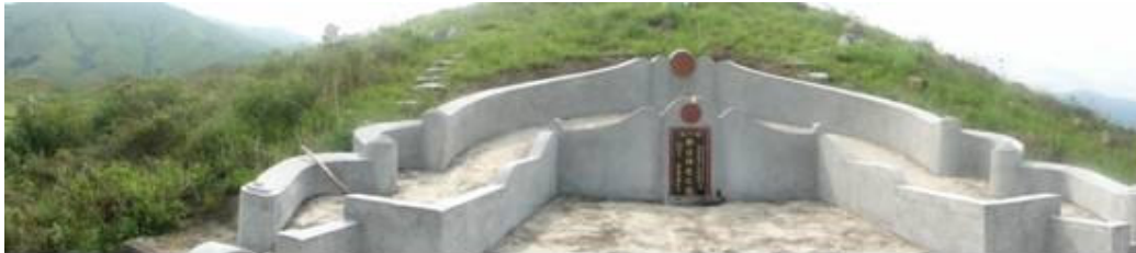
Panoramic View of Tomb 1