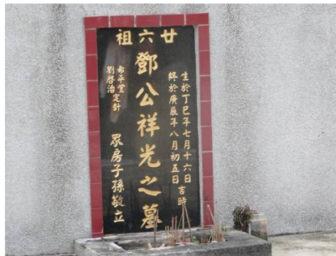
Panoramic View of Tomb 2