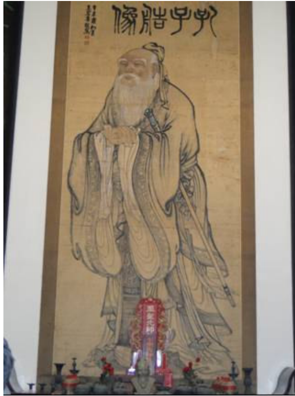
Confucious Drawings in the Temple more than 1000 years old