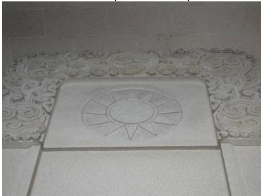
The rear side of the tomb's plate