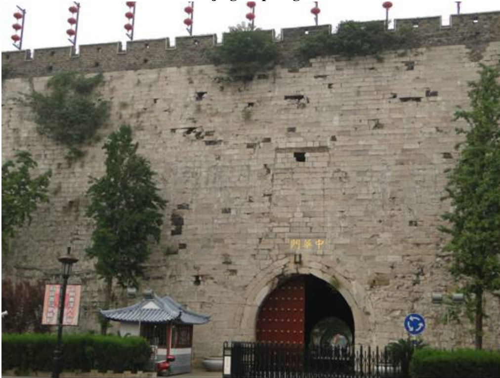
The Ancient Castle Gate to prevent enemy from entering the territory