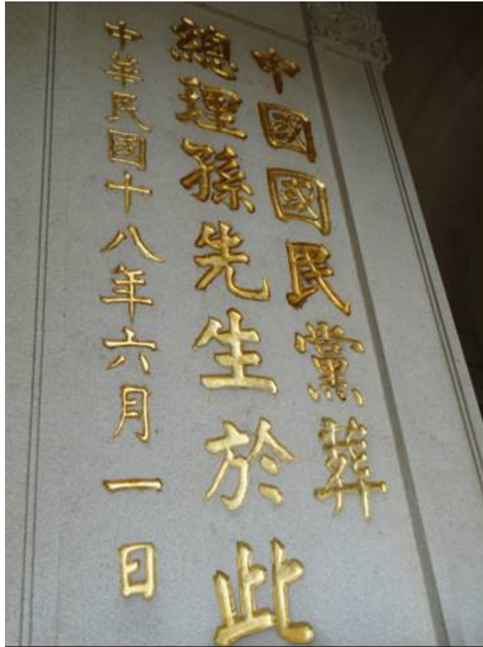
The manuscripts on the tombs' plate