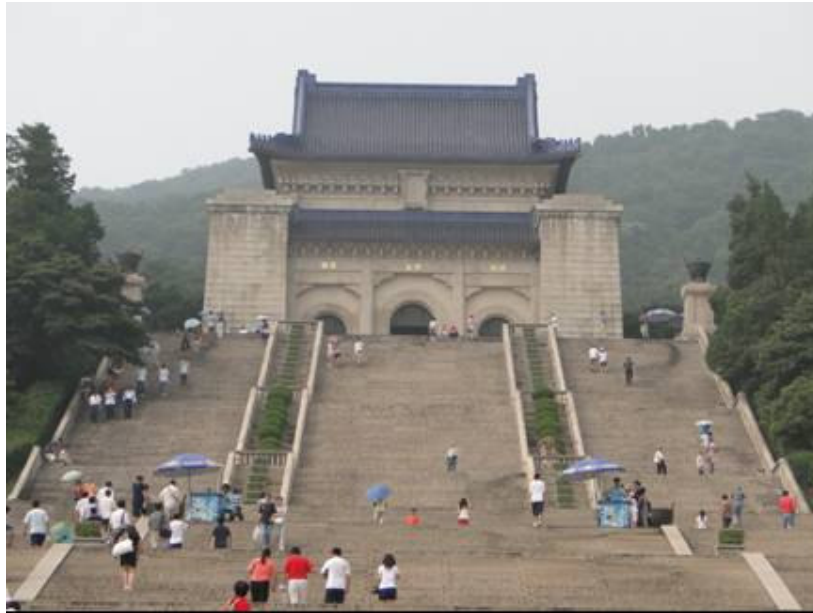
292 steps to the actual site of the Tomb