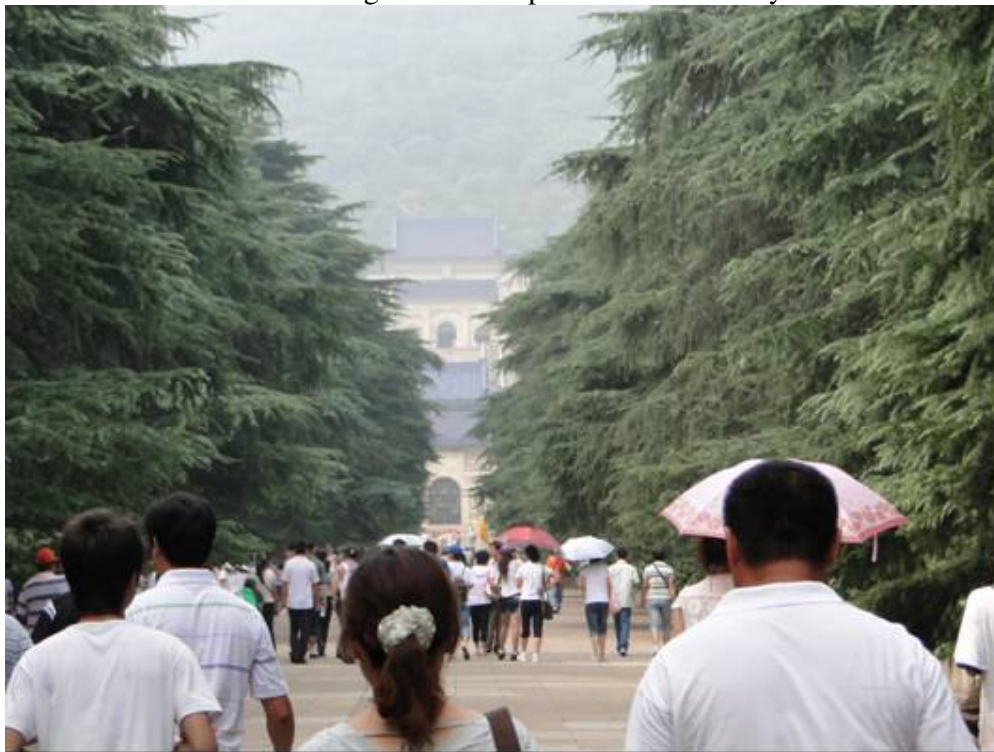
The path to DR Sun Yat San tomsite