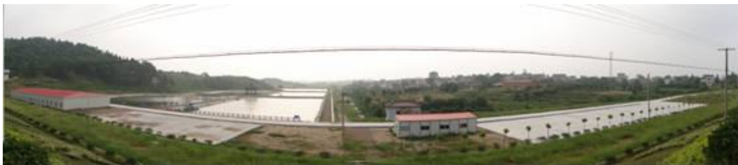
Nan Shan Lake Scene 南山湖(銅井)