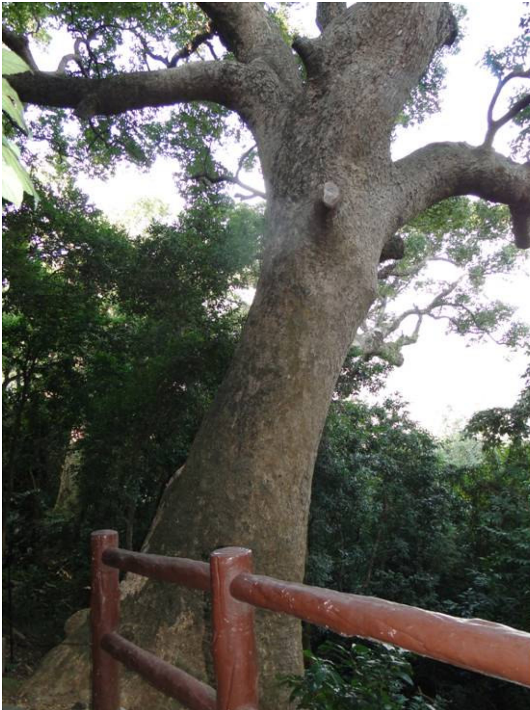
The large camphor tree more than 1,000 years old