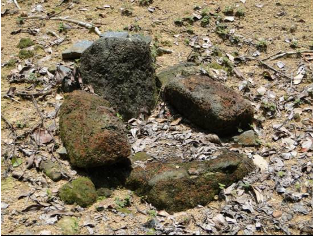
A reconstruction tomb site work in process